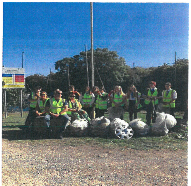
Pic: 'Beach Clean' Team Members with their 2019 litter haul