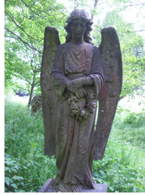
Before work commenced