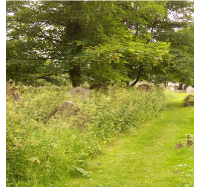
And since .....

Lydney Town Council ground staff have maintained high standards of work throughout the Cemetery and Churchyard and have continued to receive positive comments on how nicely presented both are. The 'Garden of Reflection' is beginning to settle down and the plants are maturing well. In the Cemetery the ground staff have worked hard to keep grass short and tidy, it has a weekly cut during the summer months and all affected areas have been treated with weed killer. The benches have been painted and all trees have been maintained. The shrubbery has also been attended to; dead plants have been removed, unattended graves have been tidied, paths are edged and the gates have been painted. New signage is in place and marble plaques are now clean. St Mary's Churchyard is also cut regularly which makes the whole area look neater. A wild flower mix has been