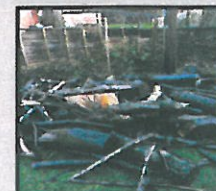
Logs/Debris removed from Trash Screen