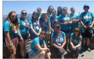
Group picture in their Girlguiding camp T-shirts