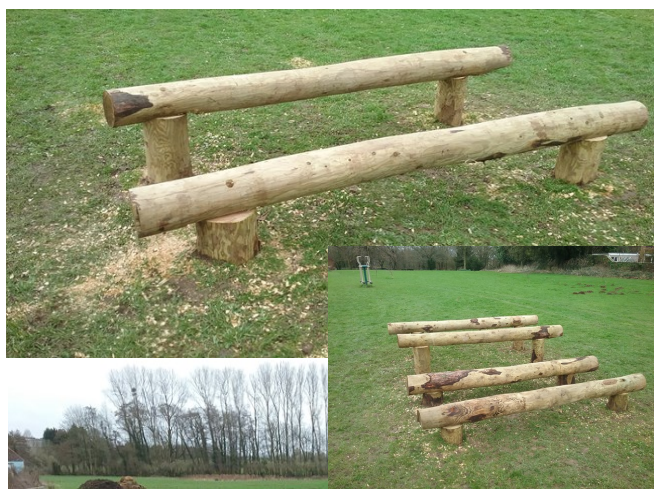
Pictures of the new 'fitness trail' and new bandstand roof in Bathurst Park. Also the new flower bed outside Bathurst Pool.

A new fitness trail has also been installed in Bathurst Park to add to the facilities offered in the Park. The bandstand has also been given a roof, its appearance now in keeping with its surroundings, lending itself to summer band performances and the like.